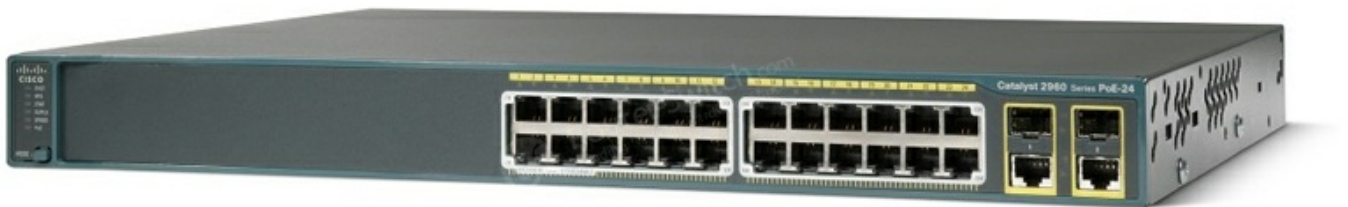
Table 1 shows the Quick Spec of the WS-C2960-24PC-L.

Figure 1 shows the appearance of the WS-C2960-24PC-L.