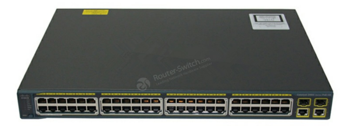
Table 1 shows the Quick Spec of the WS-C2960-48PST-L.

Figure 1 shows the appearance of the WS-C2960-48PST-L.