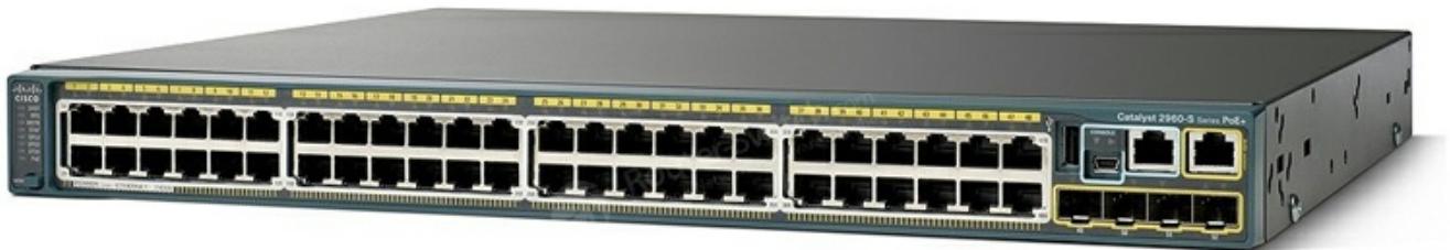
Table 1 shows the Quick Spec of the WS-C2960S-48FPS-L.

Figure 1 shows the appearance of the WS-C2960S-48FPS-L.